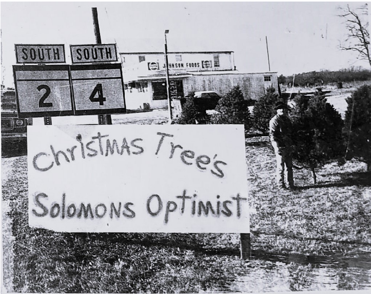
Christmas Tree Lot - 1975 Johnson Foods in the background