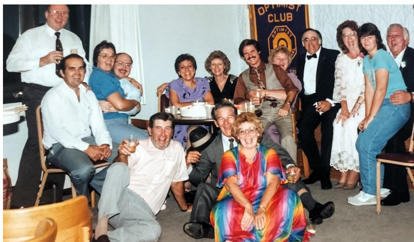
Say Cheese! Who do you recognize?

To be just as enthusiastic about the success of others as you are about your own.